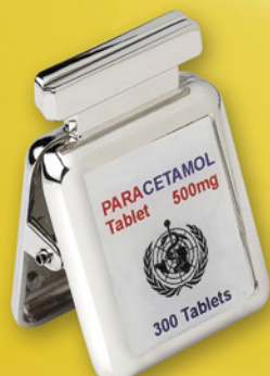
Pill Bottle Memo Clip