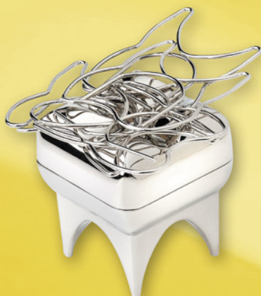
Tooth Clips Holder