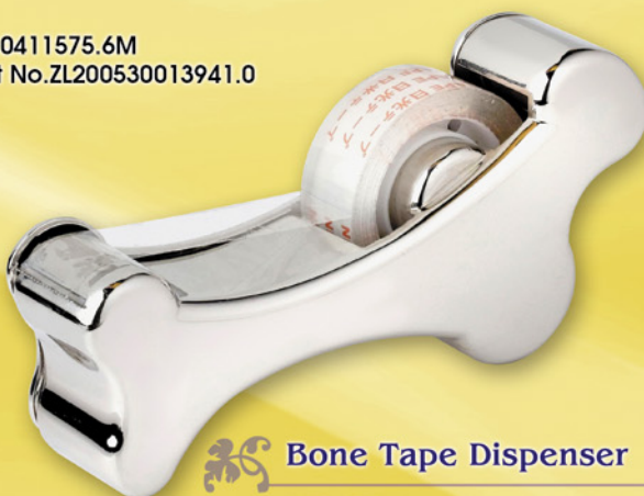
Bone Tape Dispenser