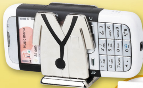
Doctor's Coat Memo /Phone Holder