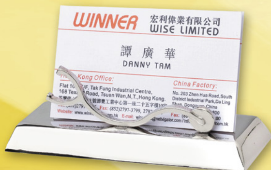
Stethoscope Card Holder